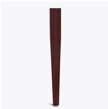
Optional Leg Style

Wheelchair height table legs are available and are optional.