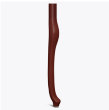
Optional Wheelchair Height

Kwalu’s solid surface (1/8” thick) proprietary finish doesn’t have any of the drawbacks of wood. The frames are moisture impervious, graffiti-resistant, easy to clean and maintenance-free.