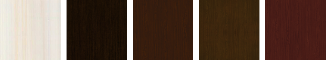
Wood Ash (Fusion)